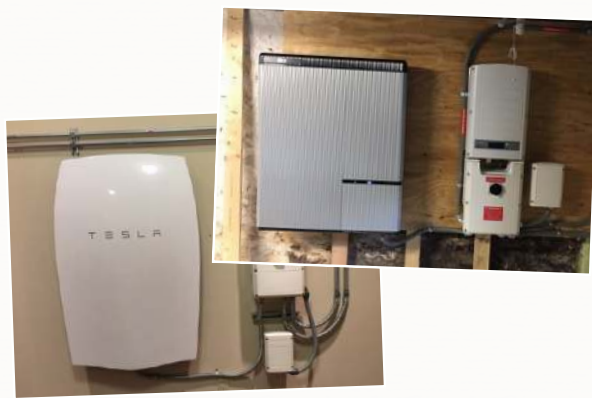
Top Right: LG RESU 10H Bottom Left: Tesla Powerwall